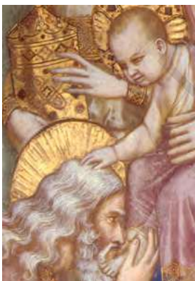
Giotto's painting of the child Jesus, Assisi, Italy.

to be known because of Dante Alighieri (1265-1321), a layman who wrote on religious themes, and Giotto (1267-1337), an artist who painted lifelike portraits, very different from the stiff figures done by earlier artists. From then it developed as the most exciting intellectual city in Italy and as a centre of artistic creativity. The term 'Renaissance Man' is often used to describe a person with many interests and skills, because many of the individuals who became well known at this time were people of many parts. They were scholar-diplomat-theologian-artist combined in one.